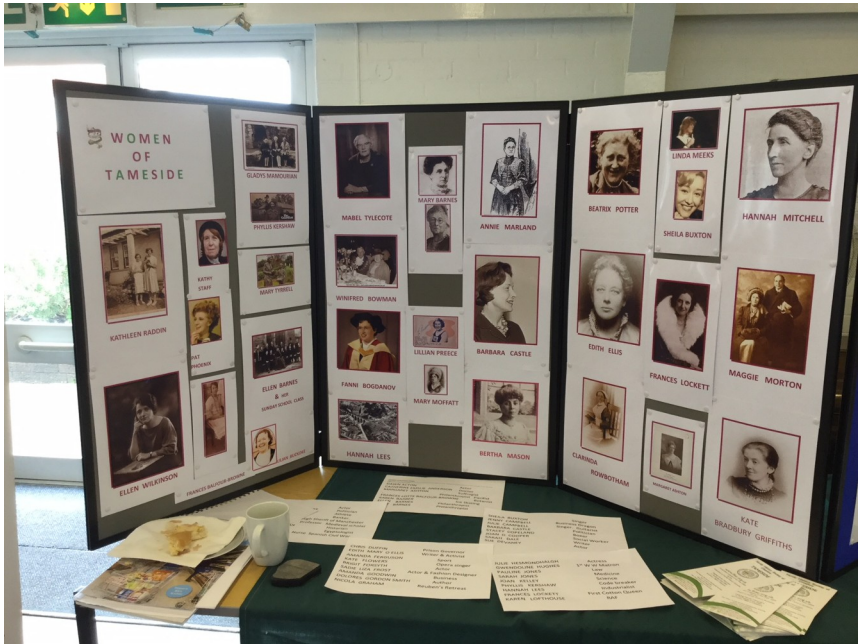
Top Women no longer with us and bottom those still alive